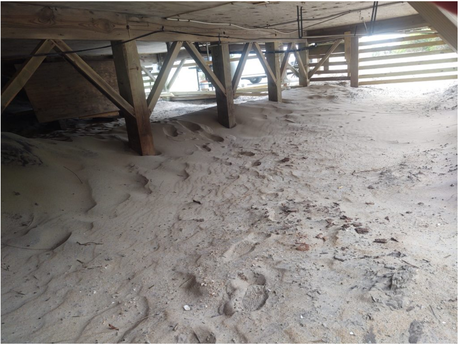
There used to be a lot of sand in here!