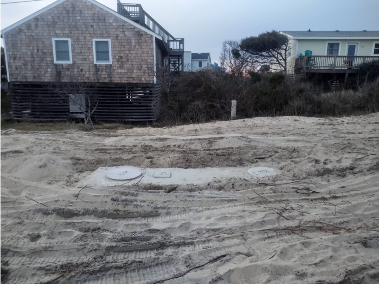
Septic tank location

This year will open with major improvements to the infrastructure. A new septic system was installed, replacing the original from 1984.