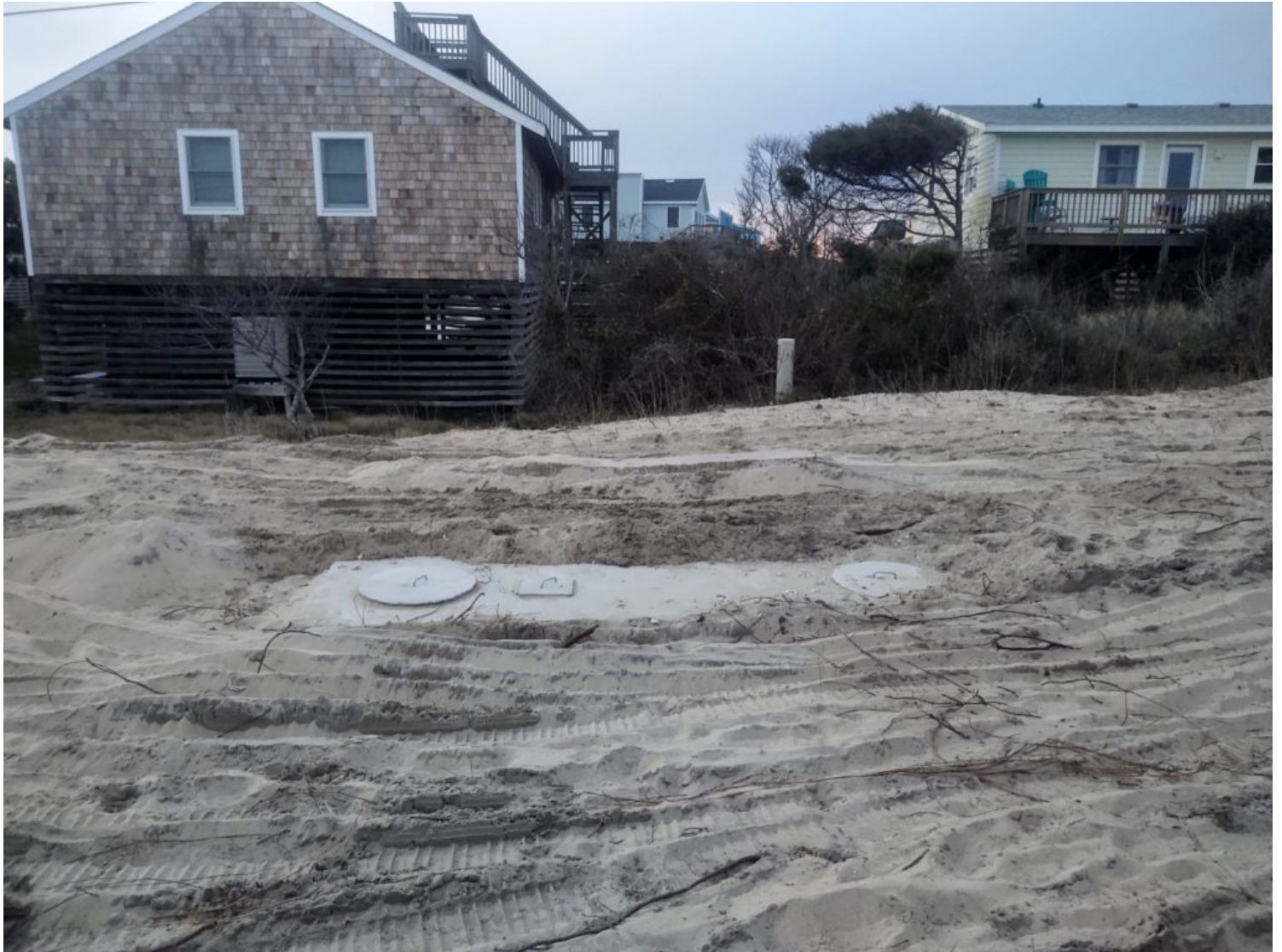
Septic tank location

This year will open with major improvements to the infrastructure. A new septic system was installed, replacing the original from 1984.