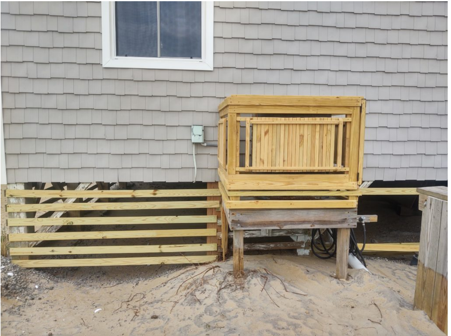
Hopefully, this will keep the sand from packing into the core.