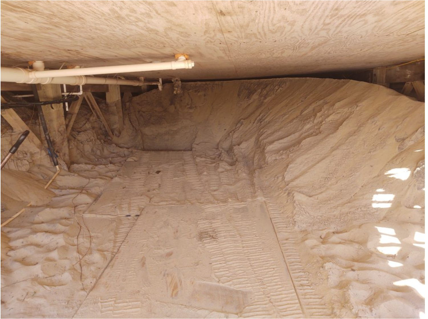
The sand had to go.