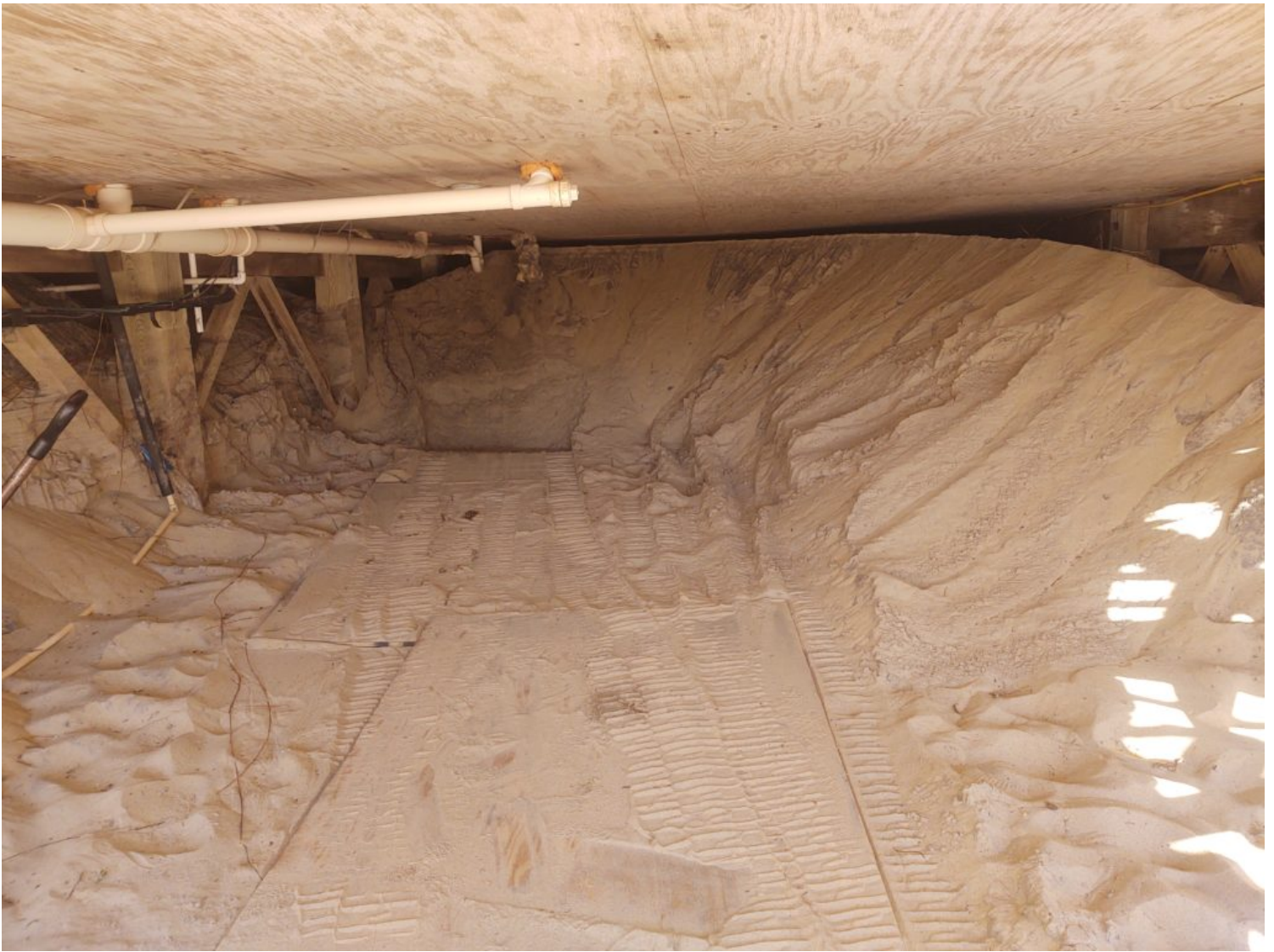
The sand had to go.