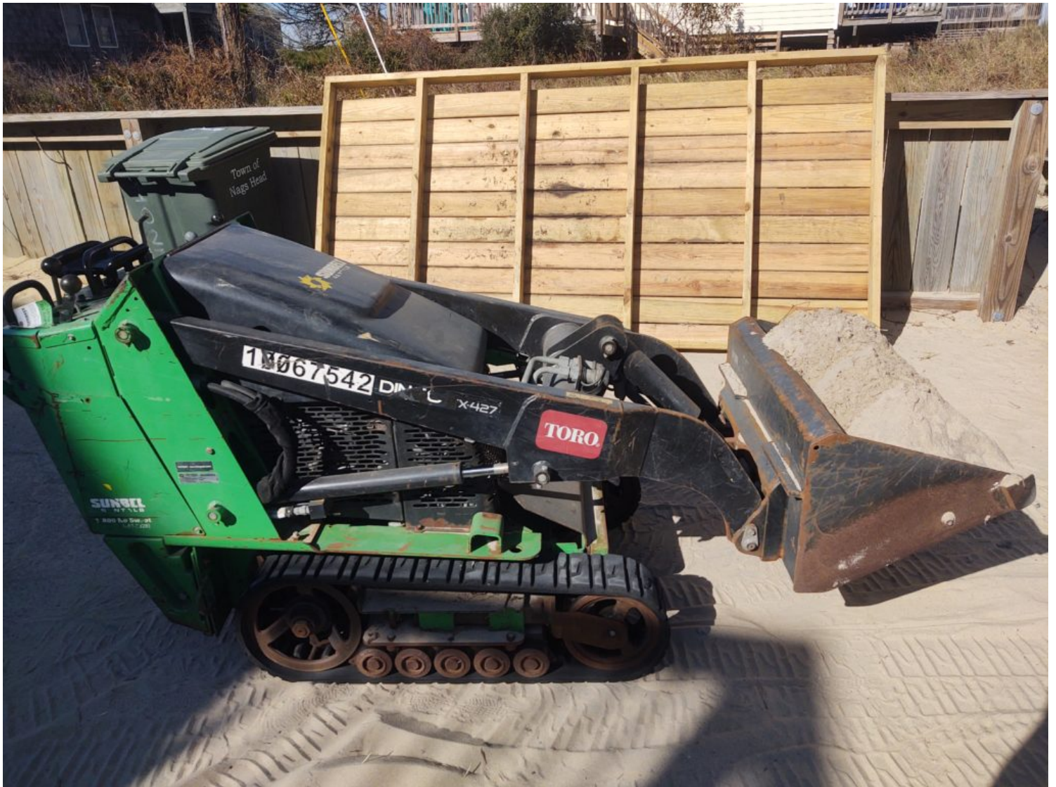
My working buddy.

The machine above we rented in the fall. It had seen better days. We rented and got the same machine in the spring from Sunbelt Rentals in Elizabeth City. It ran a couple hours and started quitting. We wasted 4 of our 7 days vacation with the unit. Sunbelt went and bought a brand new unit and brought it out to replace this one. BIG difference! They also done us right on the rental, giving us the extra time. However, I had to work it in after hours on the regular job. The final result was worth the effort, as we were able to remove all the sand from under the house.